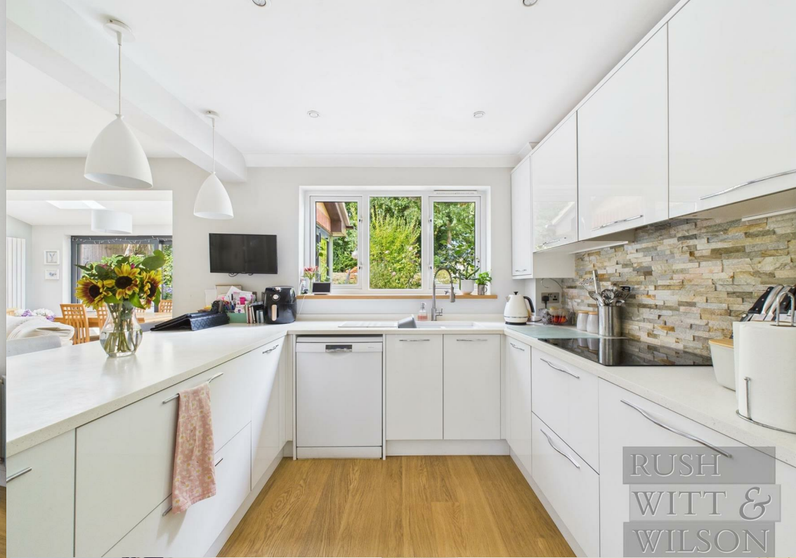
RUSH WITT & WILSON