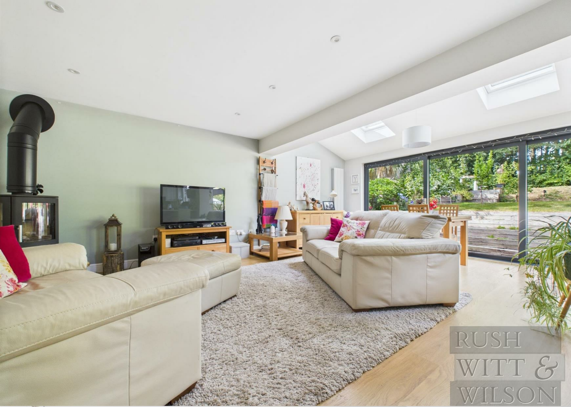
RUSH WITT & WILSON